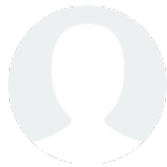
Robbie Dallaire Realty