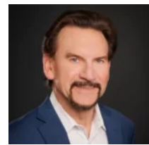
Frank Adashun Jones, Inc.