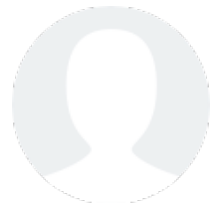
Amy Adashun Jones, Inc.