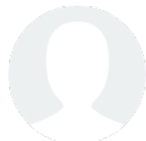
Amy Adashun Jones, Inc.