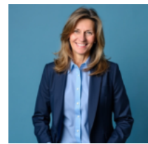
Gail Adashun Jones, Inc.