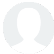
Janice Copperleaf, LLC