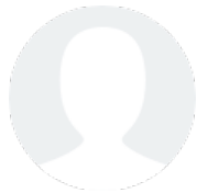
Tanner Beckman Properties