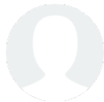
Jim Oskey Realty LLC