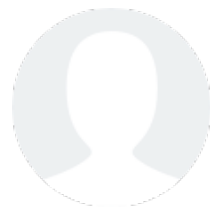
Jim Oskey Realty LLC