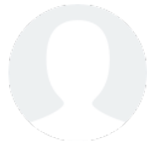
Bob First Weber, Realtors, Oshkosh