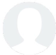
Jan Smart Move Realty, LLC