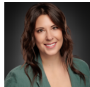
Dani Adashun Jones, Inc.