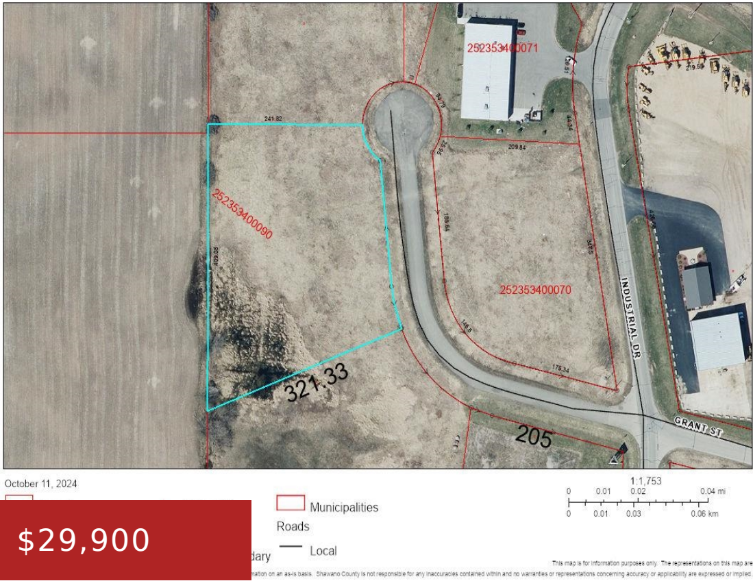
Shawano County GIS Map