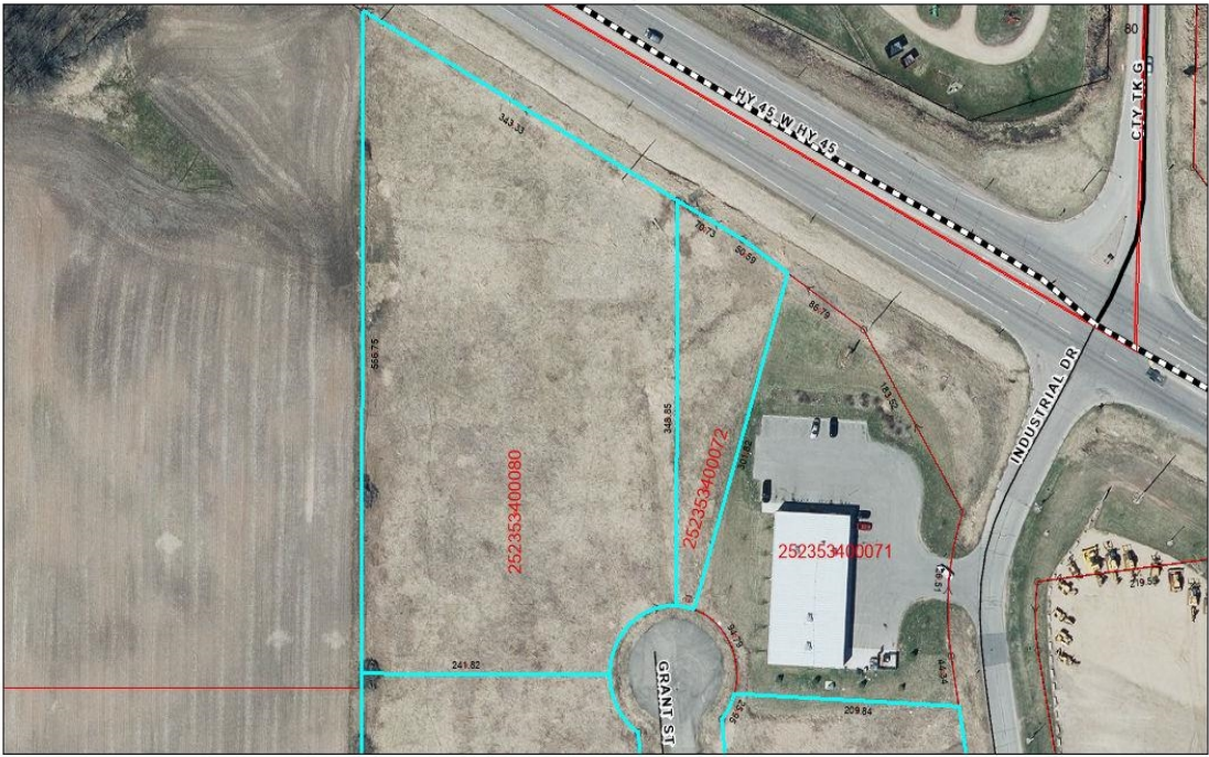
Shawano County GIS Map