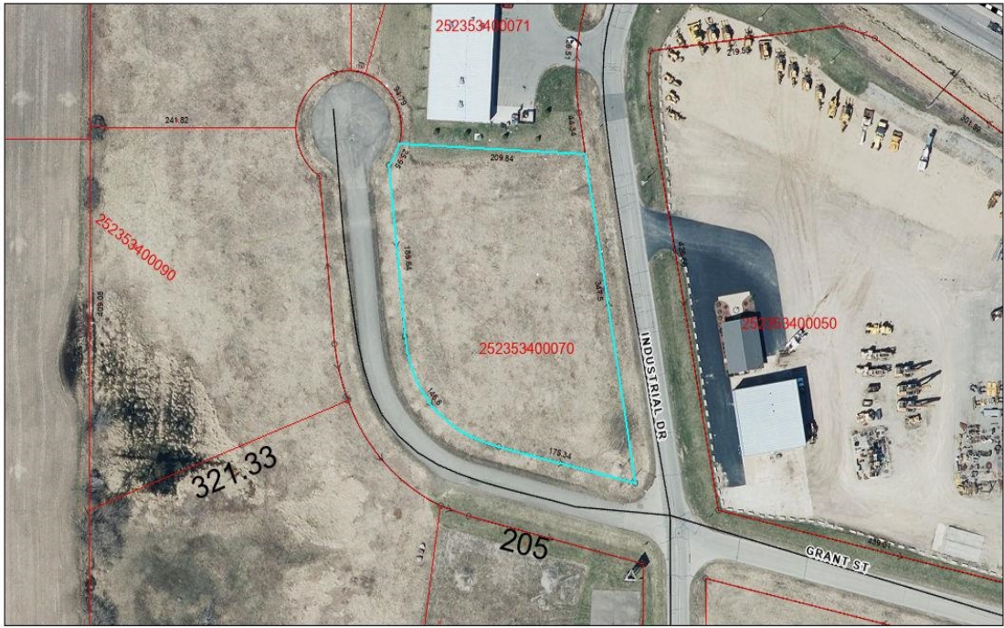
Shawano County GIS Map