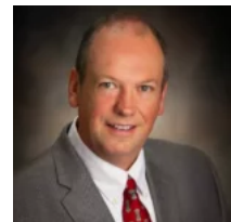
Scott Adashun Jones, Inc.

Here your chance to build your dream home, Located within walking distance to White Lake Country Club and White Lake Beach