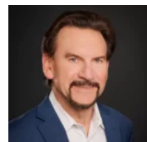
Frank Adashun Jones, Inc.