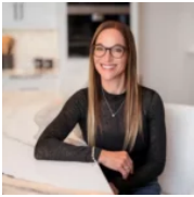
Jodi Adashun Jones, Inc.