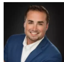
Kevin Adashun Jones, Inc.