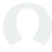
David Roberts Homes and Real Estate