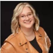
Laura Adashun Jones, Inc.