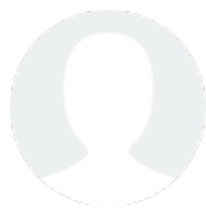
Marine Real Broker LLC