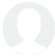
Bryan Real Broker LLC