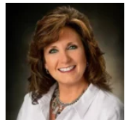
Debra Adashun Jones, Inc.