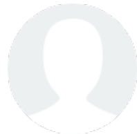
Ben Ben Bartolazzi Real Estate, Inc