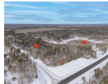
Red Key Real Estate, Inc.