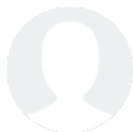
Tom Score Realty Group, LLC