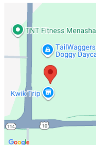
Coldwell Banker Real Estate Group

• Land • Residential, Vacant Land/Acreage • Active