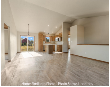
Home Similar to Photo - Photo Shows Upgrades