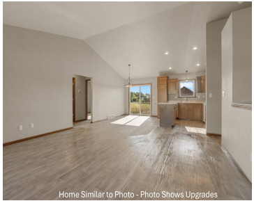
Home Similar to Photo - Photo Shows Upgrades