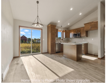
Home Similar to Photo - Photo Shows Upgrades