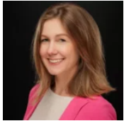
Ashley Adashun Jones, Inc.