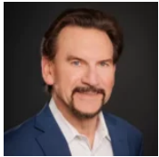
Frank Adashun Jones, Inc.