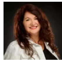
Bonnie Adashun Jones, Inc.