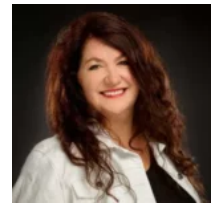
Bonnie Adashun Jones, Inc.