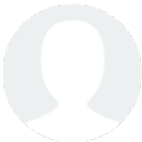
Brian Beckman Properties