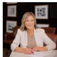
Jan Adashun Jones, Inc.