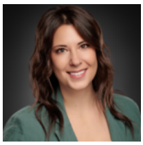
Dani Adashun Jones, Inc.