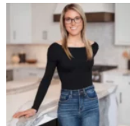
Jada Adashun Jones, Inc.