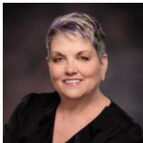
Maigon Adashun Jones, Inc.