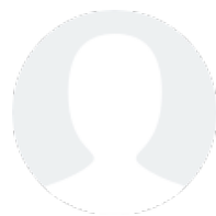
Mike Broadway Real Estate