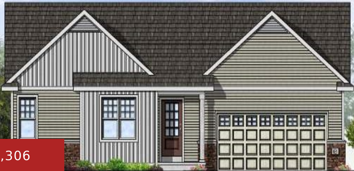
REPRESENTATIVE MODEL FOR COMPARISON

9320 Harvest Moon Lane, Madison, WI, 53593