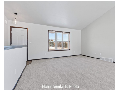
Home Similar to Photo