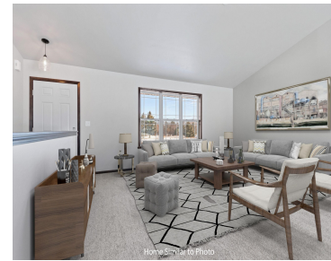
Home Similar to Photo