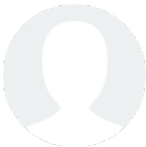
Jessica Design Realty