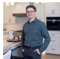
Glenn Adashun Jones, Inc.