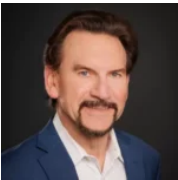
Frank Adashun Jones, Inc.

Cozy 2BR, 1BA ranch needs your attention to become a warm & inviting home! Full basement & 2 car garage.