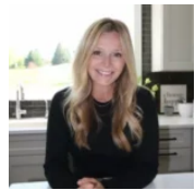
Kelly Adashun Jones, Inc.