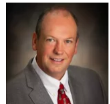
Scott Adashun Jones, Inc.