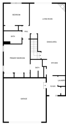
FOR MARKETING PURPOSES ONLY