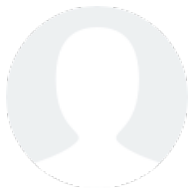
Pat Coaction Real Estate, LLC