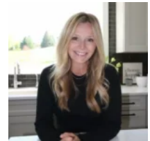
Kelly Adashun Jones, Inc.