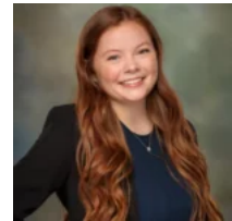
Molly Adashun Jones, Inc.