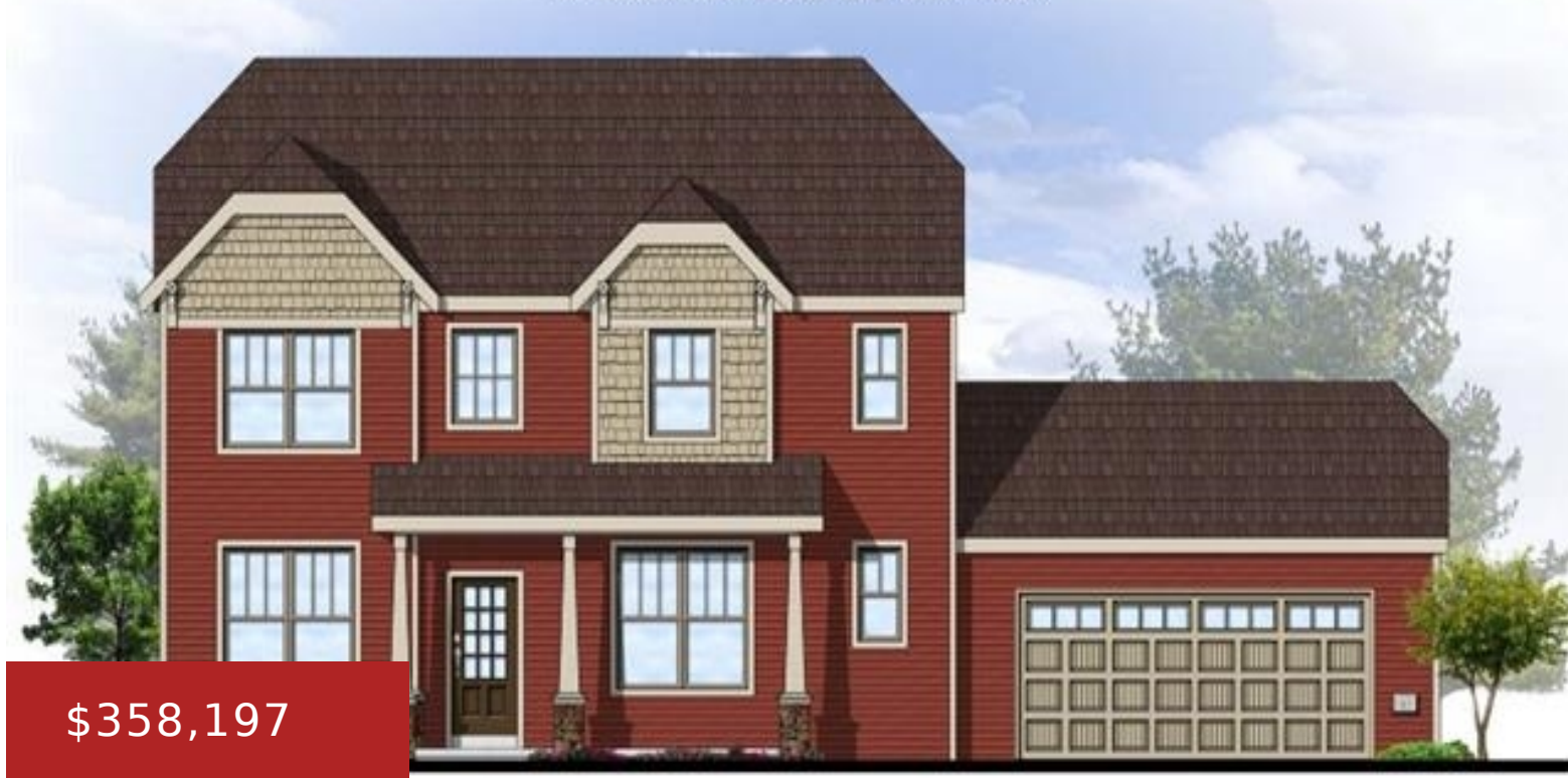
REPRESENTATIVE MODEL FOR COMPARISON