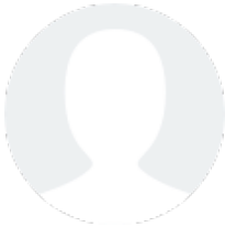
Dave AXEN Realty, LLC