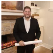
Glenn Adashun Jones, Inc.